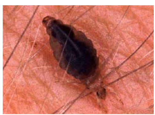
Head louse adult.

In the United States, approximately 10-12 million people, mostly children, are infested annually with head lice, Pediculus humanus capitis DeGeer. The first indication of an infestation is the itching and scratching caused by these bloodsucking insects. Examination of the hair and scalp will usually reveal the white or grayish crawling forms (about the size of a sesame seed) and yellowish-white eggs (nits) attached to the hair shafts close to the scalp.