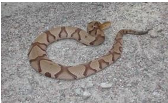
Copperhead. J.D. Willson

Once it is determined that the snake is non-venomous, don't overreact to a snake in a classroom. Students learn behaviors from the adults in their life, especially teachers. This child has a natural curiosity of snakes because her parents do not react to snakes in a fearful manner.