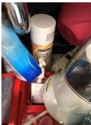
Flying and Crawling Insect Killer Premise Spray can in an unlocked, floor cabinet of a Pre-K classroom.

I'm hoping that with repetition I will finally get my message through to school personnel and those that work in schools. We continue to find head lice premise spray cans in kindergarten or pre-K classrooms, and sometimes they, along with cleaners, are accessible to children in unlocked floor cabinets. This is wrong on many levels. Pesticides are dangerous in the hands of children. This violates the label which indicates to keep out of the reach of children. In addition, it is against the law for anyone to apply a pesticide in a school that is not under the supervision of a licensed operator (TCA 62-21-124). And, premise sprays are not needed to control head lice.