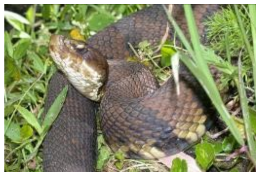
Cottonmouth.