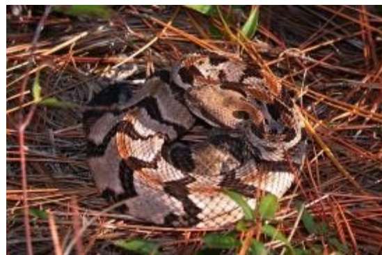
Timber rattlesnake.