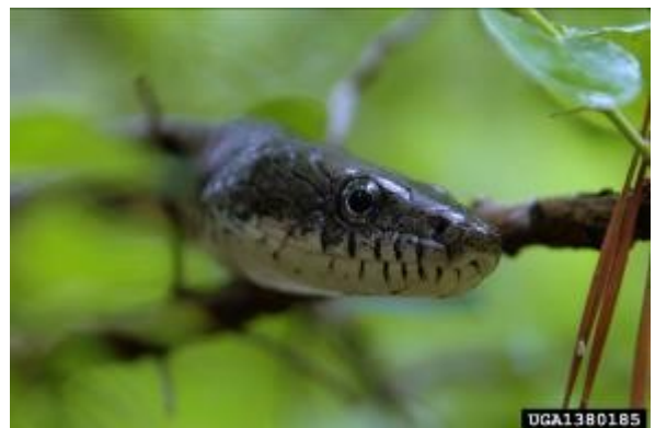
A non-venomous gray rat snake lacks the facial pit between the nostril and eye.

Comparison of venomous and non-venomous snakes. http://buckeyeherps.blogspot.com/2011/09/ohio-snake-identification-venomous-or.html