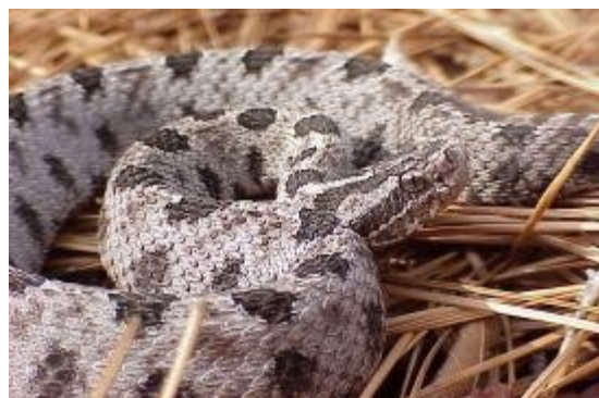
Pygmy rattlesnake.