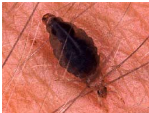
Head louse adult.

In the United States, approximately 10 – 12 million people, mostly children, are infested annually with head lice, Pediculus humanus capitis DeGeer. The first indication of an infestation is the itching and scratching caused by these bloodsucking insects. Examination of the hair and scalp will usually reveal the white or grayish crawling forms (about the size of a sesame seed) and yellowish-white eggs (nits) attached to the hair shafts close to the scalp.