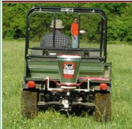
Applying fire ant bait using a herd seeder mounted on an ATV.

We recommend broadcasting a fire ant bait twice a year to suppress fire ant populations. Temperatures should be in the 70s and 80s (F)