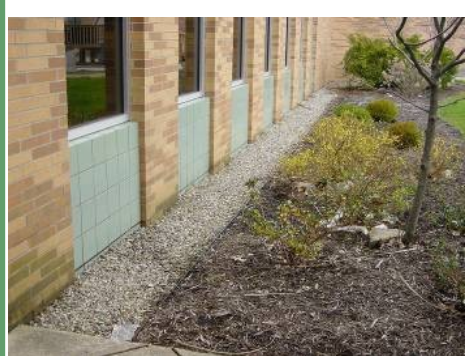
Keep a vegetation-free zone next to school.

As pest managers, you are diagnosticians of pest problems for your district and naturally fall into an educator role. Share this Pest Press with school principals and encourage them to pass it along to staff. Use archived issues to help your educational efforts. If school staff does their part, it makes your job much more efficient.