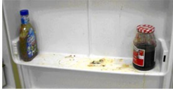
Cockroaches live contentedly in the seals of refrigerator and microwave doors. Appliances need to be cleaned regularly, and refrigerators emptied before breaks. To increase accountability, consider drawing up schedule for lounge staff. Snyder & Gouge, U of AZ

• Report leaky faucets, wet spots, or water damage in ceilings and walls (indoors and outside).