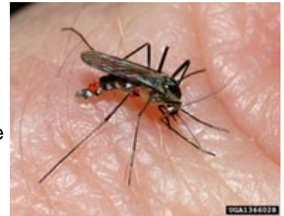
Eastern treehole mosquito.

Please read the above articles carefully. Wearing repellent is one of the best ways to protect oneself from being bitten. Because repellents are applied to a person, it's my understanding that the Tennessee Department of Agriculture does not require that they be applied under a licensed operator, as indicated in TCA 62-12-124. Educate folks about wearing repellent. Decide where repellents can be stored, who will apply them and what formulations are suggested. Reduce standing water and if it can't be removed, treat it with Bti ( Bacillus thuringiensis israeliensis ) or methoprene to kill the larvae. Wear loose-fitting clothes and avoid areas with heavy mosquito populations. Avoid areas with overgrown vegetation which may be harboring resting mosquitoes during the day time. Limit time outdoors during dusk and dawn, although the Asian tiger mosquito can be active during the day. If necessary, the underside of foliage can be sprayed with a pyrethroid to treat mosquito daytime resting sites. Be sure to follow the label and the tenets of IPM ( schoolipm.utk.edu ).