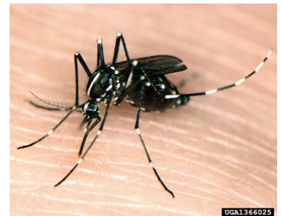
Asian tiger mosquito.