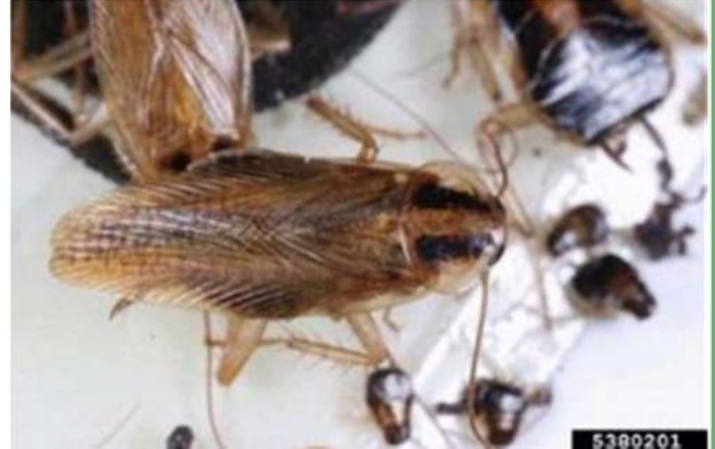
German cockroach adult with nymphs.

Follow these steps to help keep your classroom pest free. Not only do pests disrupt the learning environment, they are also a source of allergens and asthma triggers.