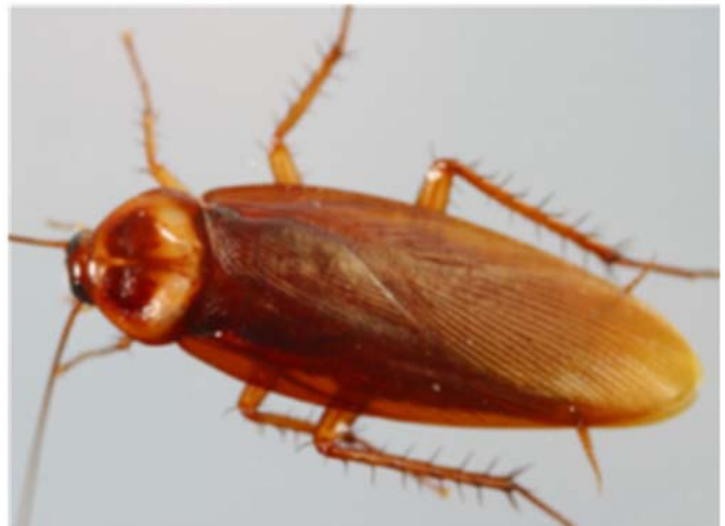
Adult American Cockroach.