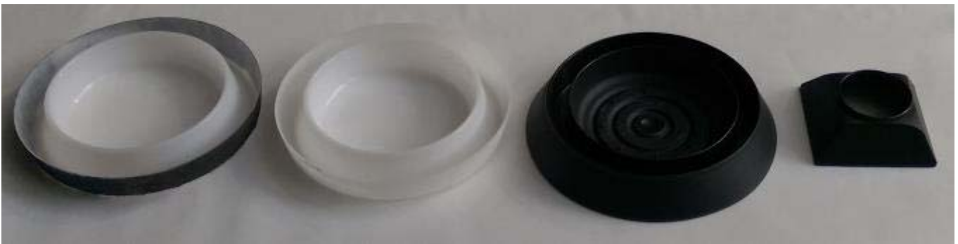
Bed bug pitfall monitors (ClimbUp Insect Interceptor BG, ClimbUp Insect Interceptor, BlackOut or LightsOut Bedbug Detector and SenSci Volcano)

Step 10. ClimbUp Insect Interceptors, BlackOut Bedbug Detectors or similar bed bug detection devices can be placed under bed or furniture legs to aid detection of new infestations and protect against re-infestation. Pull beds away from walls and don't allow bedding to touch the ground to prevent bed bugs from accessing the bed without climbing up the interceptor. Prevent pet hair from accumulating in the monitor so it does not form a bridge for the bed bugs.