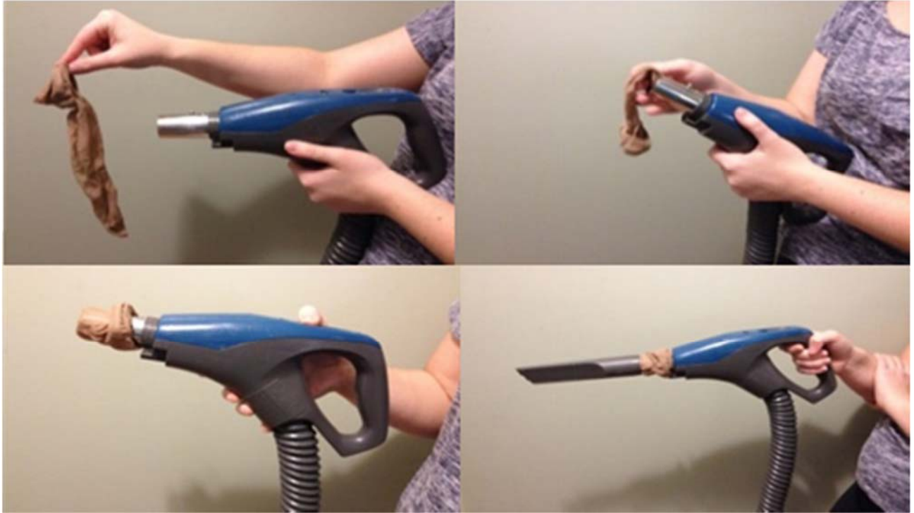
Regularly vacuum beds and upholstered furniture to remove bed bugs while population levels are low .

Step 8. Vacuum beds and upholstered furniture regularly. Place a knee-hi stocking in the vacuum tube and fold the end back over the nozzle so the crevice tool attachment will hold it in place. After vacuuming vigorously along seams and folds, remove the knee-hi, tie it off, place it in a sealable plastic bag and dispose in an outdoor trash can, but not the trash chute.