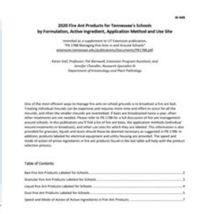
Figure 2. Fire Ant Products for Tennessee's Schools by Formulation, Active Ingredient, Application Method and Use Site , https://fireants.tennessee.edu/wp-content/uploads/sites/208/2020/11/Publications-AvailableProductsForSchools-W649.pdf

And an entire website devoted to the biology, identification and management of fire ants in Tennessee, using a very imaginative website name, FIRE ANTS IN TENNESSEE, with a similar URL, https://fireants.tennessee.edu/ .